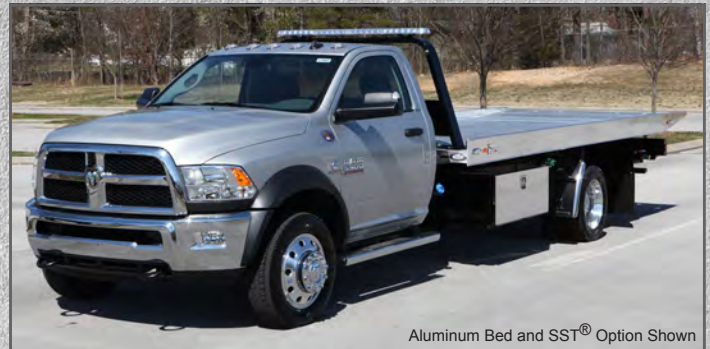
Aluminum Bed and SST® Option Shown

NOTE: The outside frame rails of the chassis extending behind the cab must be free of fuel tanks, air tanks, battery boxes, exhaust stacks, etc.