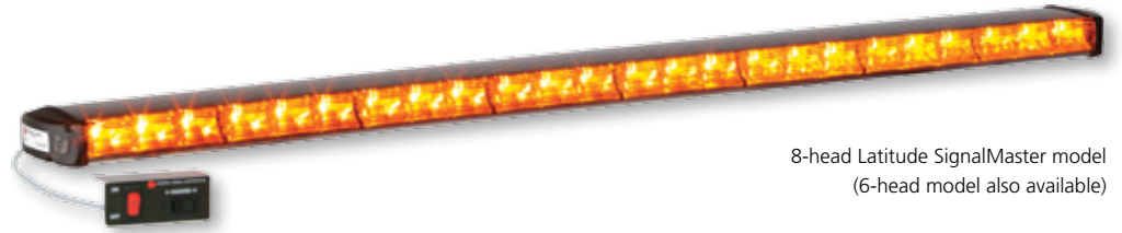
8-head Latitude SignalMaster model (6-head model also available)