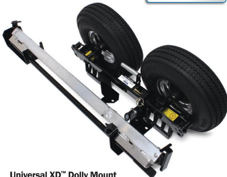
Universal XD™ Dolly Mount ITD1182

Fits XD™ Dolly Only Product Weight: 32 lbs.