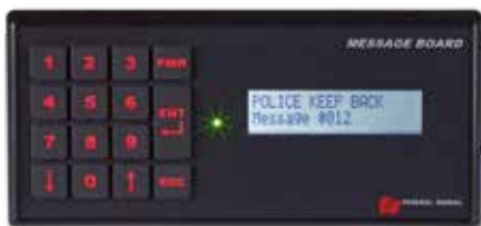
Control head enables the operator to activate the LED message board with tactical push-button control.

MB1 models have pre-programmed messages or custom messages can be created using PC based software. A name of up to 20 characters can be assigned to each programmed message. The message displayed across the message board will also display across the control head. Using the message based software, programmed messages can also be copied to other vehicle message boards.