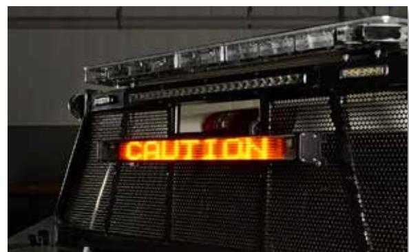
MB1 mounted on a headache rack installed on a Chevrolet Silverado