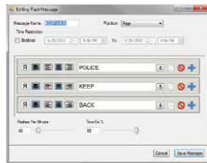
Customize messages are created and named using PC based software.