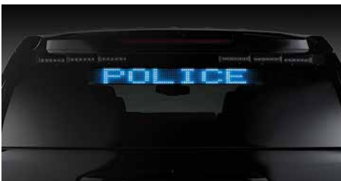
MB1 mounted on a Ford Police Interceptor Utility