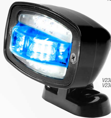
V23BTPB with V23PEDC