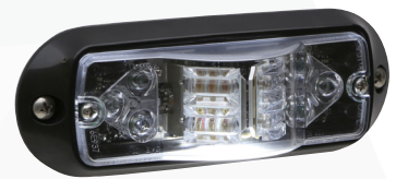
White ground illumination