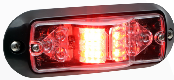
SAE 845 Class 1, 180° warning

Featuring Whelen's innovative optic technology, V-Series Super-LED® lightheads are versatile and efficient. Utilizing multiple planes of light in one lighthead, models are available in a variety of sizes for use in numerous applications. Hard-coated lenses minimize environmental damage from sand, sun, salt, and road chemicals.