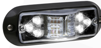
White steady-burn flood/alley