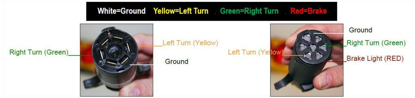
7-Pin RV Style